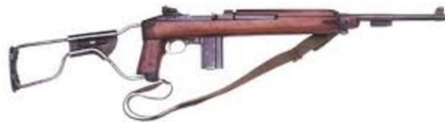
M1A1 Cal. .30 Carbine with folding metal stock